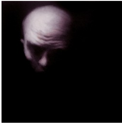
I know everything.