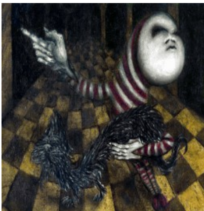
Or was it you?