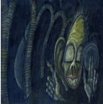
Don't ask me.