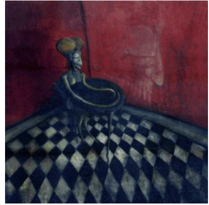
Was it me? Us? Them?